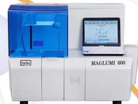
Maglumi 600 180T/H