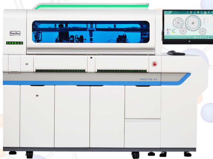
Maglumi X8 600T/H