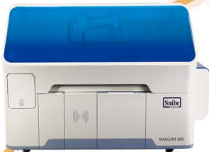
Maglumi 800 180T/H