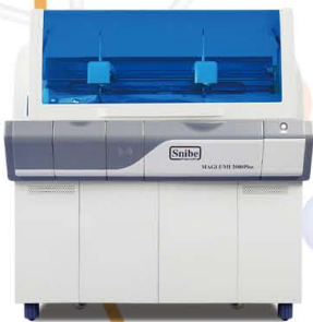
Maglumi 2000 Plus 180T/H