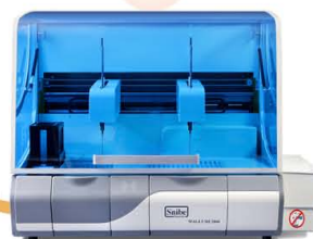
Maglumi 2000 180T/H

Analizzatori per la completa Automazione di Immunodosaggi in Chemiluminescenza (CLIA)